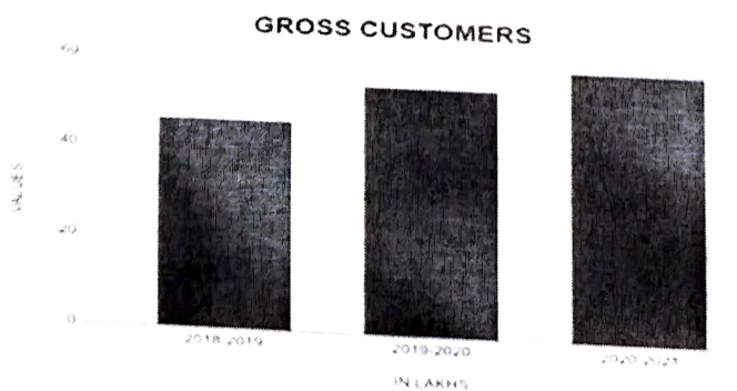
TABLE 1: USFB-CUSTOMER BASE

Ujjivan Small Finance Bank onboarded approximately 2,00,000 unique customers for digital payments, with more than Rs 123 crore of EMIs collected in just five months and the conversion rate from digital channels growing from 2% to a whopping 18%. The martech stack and engagement solutions have also helped the bank stay ahead of the competition.