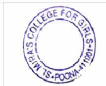
Komal Tujare Course Instructor