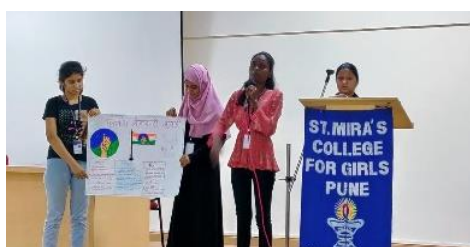
Figure 2: Marathi medium students making class presentations

The lectures covered essential topics in politics and public administration. Adaptations were made to ensure marathi medium students could grasp the subject matter, including the provision of additional resources. This approach ensured active participation and comprehension among the students.