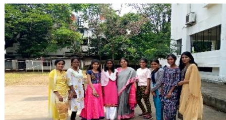
Figure 3: FY Marathi medium students with their faculty

We plan to continue refining our approach to benefit Marathi medium students in the future.