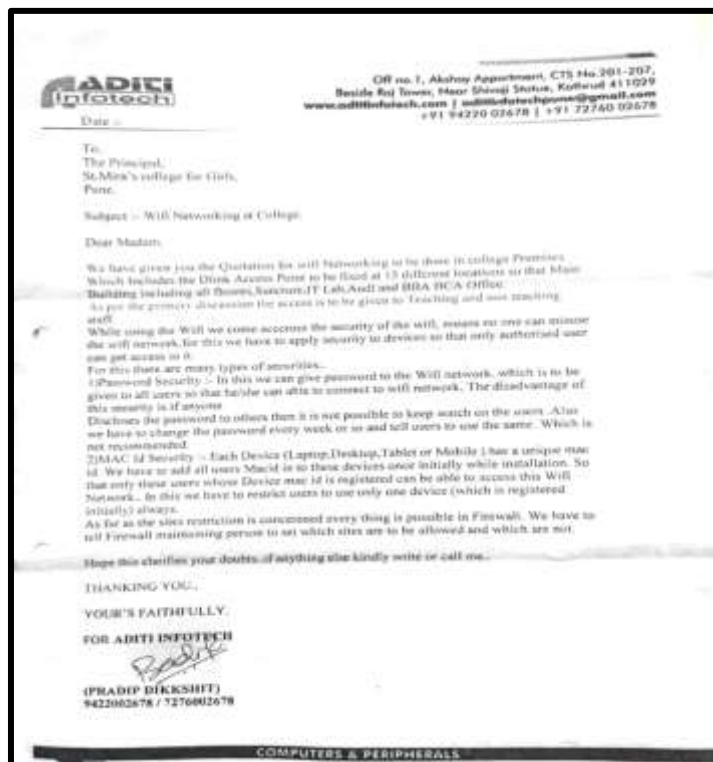
WI-FI Report Page 2