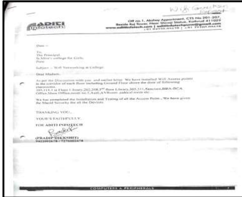
WI-FI Report Page 1