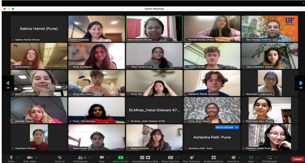
Pic: MILE 2023-24 Collaborative Session

The collaborations were conducted via Zoom, Flipgrid and the Padlet platforms ( https://flipgrid.com/groups/15419458/topicshttps://padlet.com/suhaza2508/comparative-perspectives-on-gender-inequality-in-india-and-t-abjx5bv19jnlio5z )